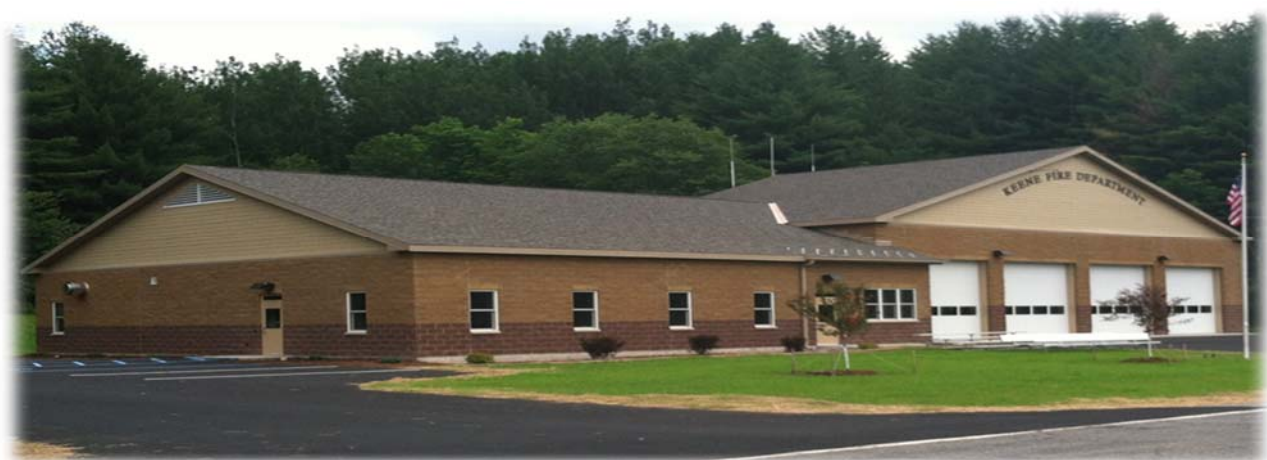
Union Hill Fire Department